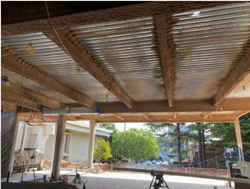
First floor fireproofing