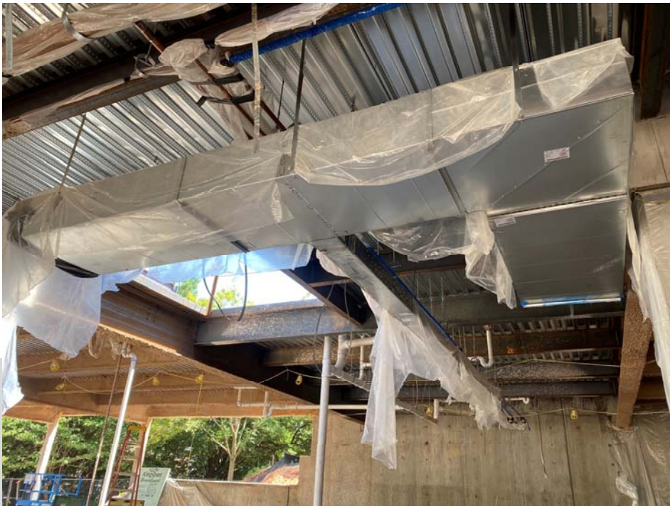
HVAC Ductwork Install