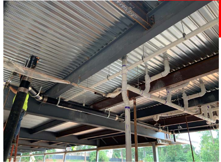
First floor plumbing overhead rough in