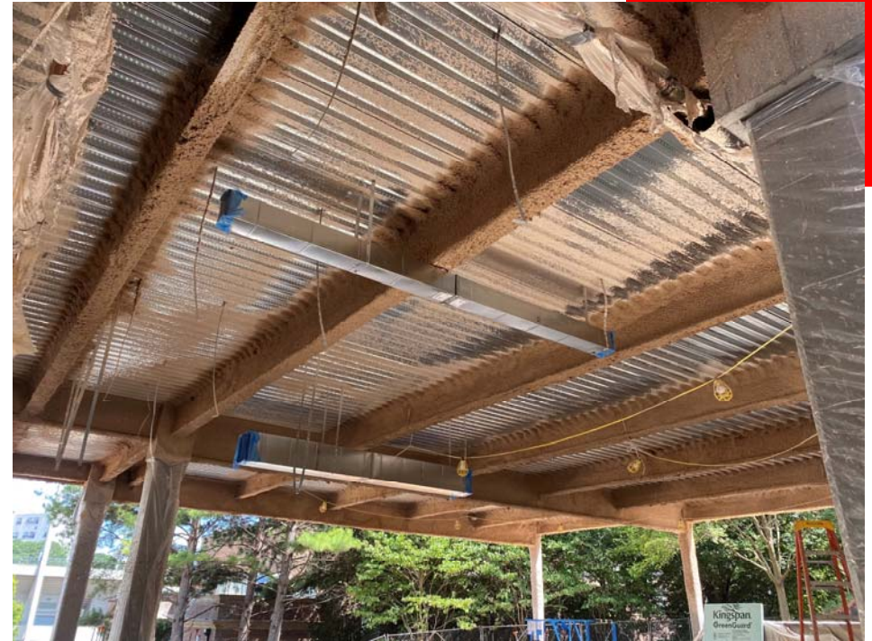
HVAC Ductwork Install