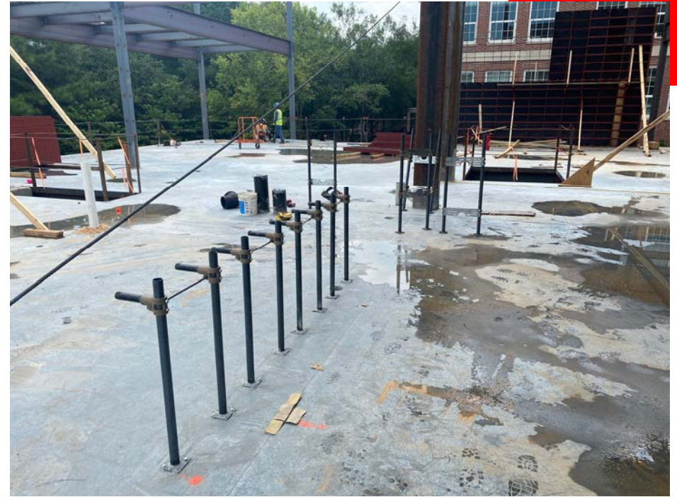
Second floor plumbing rough in.